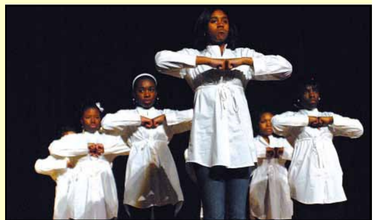
The Potomac Middle School Steppers perform a step routine while at the same time reciting black history information during a Black History Month theater presentation Feb. 21 at Quantico's Little Hall. Stepping has African roots and is an African-American tradition.