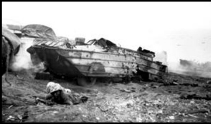
D-day Iwo Jima, February 19, 1945. On the beach at Iwo Jima, two African-American Marines work their way ashore past the smoldering carcass of a DUKW all the while under blistering Japanese machine gun, mortar, and artillery fire. They struggled in the volcanic sand to set up ammo and supply dumps.

a Stetson hat,” he said. The first Marine superior he greeted took the hat and stomped it.