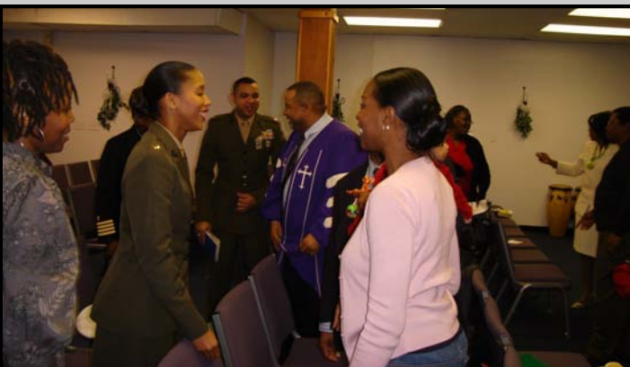
Members of the NNOA Quantico Chapter fellowship with Emanuel Bible Fellowship church members after the church visit on March 9th.

These types of individuals are a hindrance to you, they come to sabotage you. If they criticize everything that you say and do or make you feel bad or ashamed and won't share in your happiness you need to reevaluate that relationship.